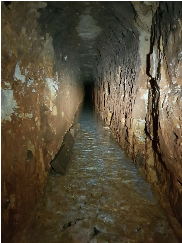
Figure 4. One of the “lateral” galleries in the Cretaceous chalk of Hesbaye still in use for the water supply of the City of Liège by the Public Water Company of the Liège area (“Compagnie Intercommunale des Eaux de Liège” CILE).

City of Liège. He discussed the “influenced” zones of the future galleries and how to optimize their depth in the aquifer for avoiding too strongly induced drawdowns in the many existing wells used for agricultural purposes. Moreover, he elaborated on how the water flow in the future network of galleries could be blocked by a simple dam in the aqueduct at a location away from the valley and avoiding any local flooding as the water would be kept in the chalk aquifer itself.