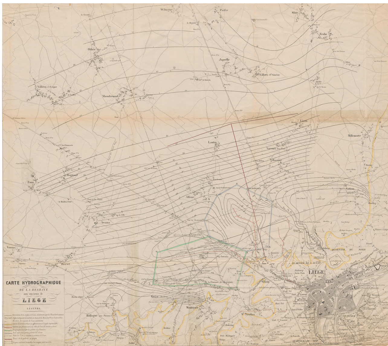
Figure 2. The potentiometric map (named “hydrographic map”) of the Hesbaye aquifer as drawn by Gustave Dumont in his report, dated February 10, 1856 (Dumont 1856). As mentioned in French in the legend (lower left of the figure), the contours are “the intersection between the underground water surface with horizontal planes.” The red lines central in the map are the proposed excavations in the chalk for an aqueduct from “Ans” to “Lantin” (about 5 km in length) and two connected water supply galleries.

présentés pour procurer à la Ville des eaux alimentaires ” (Report for the City of Liège’s Council about projects for providing drinking water) (Dumont 1856). This report was published in the “ Bulletin administratif de la Ville de Liège ” (Administrative bulletin of the City of Liège).