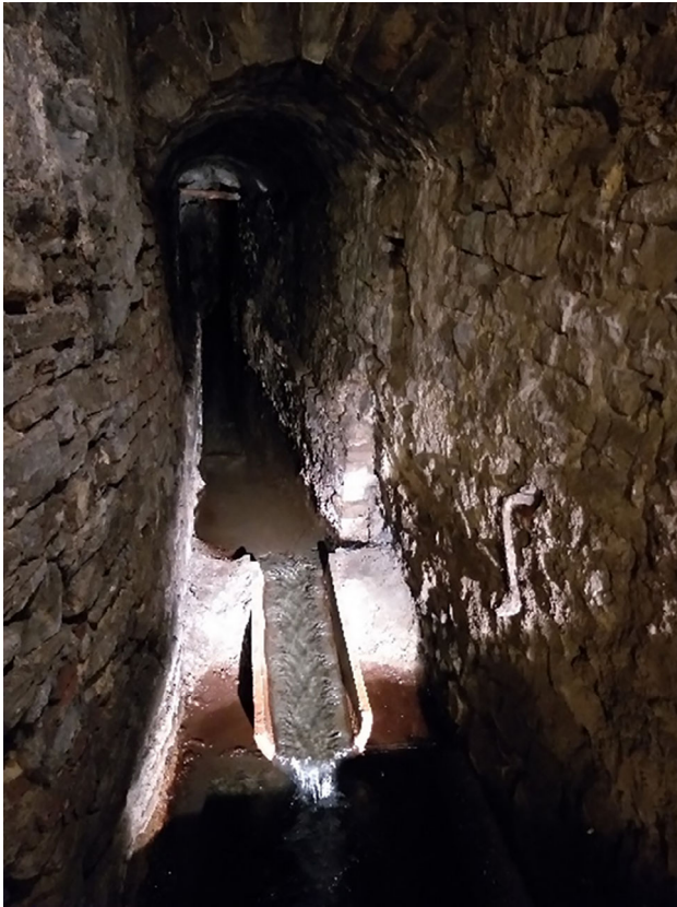
Figure 1. Mouth of the Richefontaine drainage gallery network, one of the four “ areines franches ,” just before entering the drinking water fountains. Photo by A. Anceau, 20 September 2020.

by smaller drainage galleries or by voids left after the mining (de Crassier 1827). From the beginning of the 17th century, with the deepening of the mine works, a drainage gallery, higher in altitude, could be merged with another drainage gallery at a lower elevation. Such drainage connections supported coal mining and decreased the cost of the exploitation. Each drainage gallery consisted of a network of galleries dug into the rocks. Taking advantage of the valley topography, the drainage galleries dewatered mines mainly by gravity for five centuries (Gaier 1988, 2012).